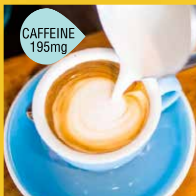
GREEN EYE A green eye uses 3 espresso shots with its drip coffee, a coffee to help pull through an especially sluggish day.

FLAT WHITE 1 part espresso, 2 parts steamed milk. A bit like a latte, only with a little less milk. A double shot of espresso topped with microfoam milk, so you get a smooth texture.